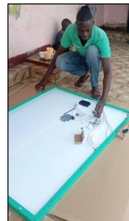
preparing for installation

Electricity supply in Arusha is unreliable with many “brown-out” events. This is when supply is withdrawn from a district for several hours. SAO asked AKT to provide a solar panel to run four lights.