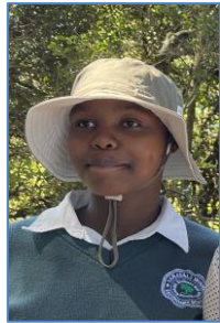
J(L) and A

While we still have a few students going through their Primary education at Blue Sky and Haradali Primary, the majority we sponsor are in Secondary schools and beyond. At Haradali Winners, J and A are in Form 3. Je and R are in their final year, Form 4. At Unambwe Secondary, J and P are in Form 3 and M is in Form 2 and we have six students in Form I. We are very pleased that J and A scored high marks in the end of Form 2 FTNA national exams at the end of 2023.